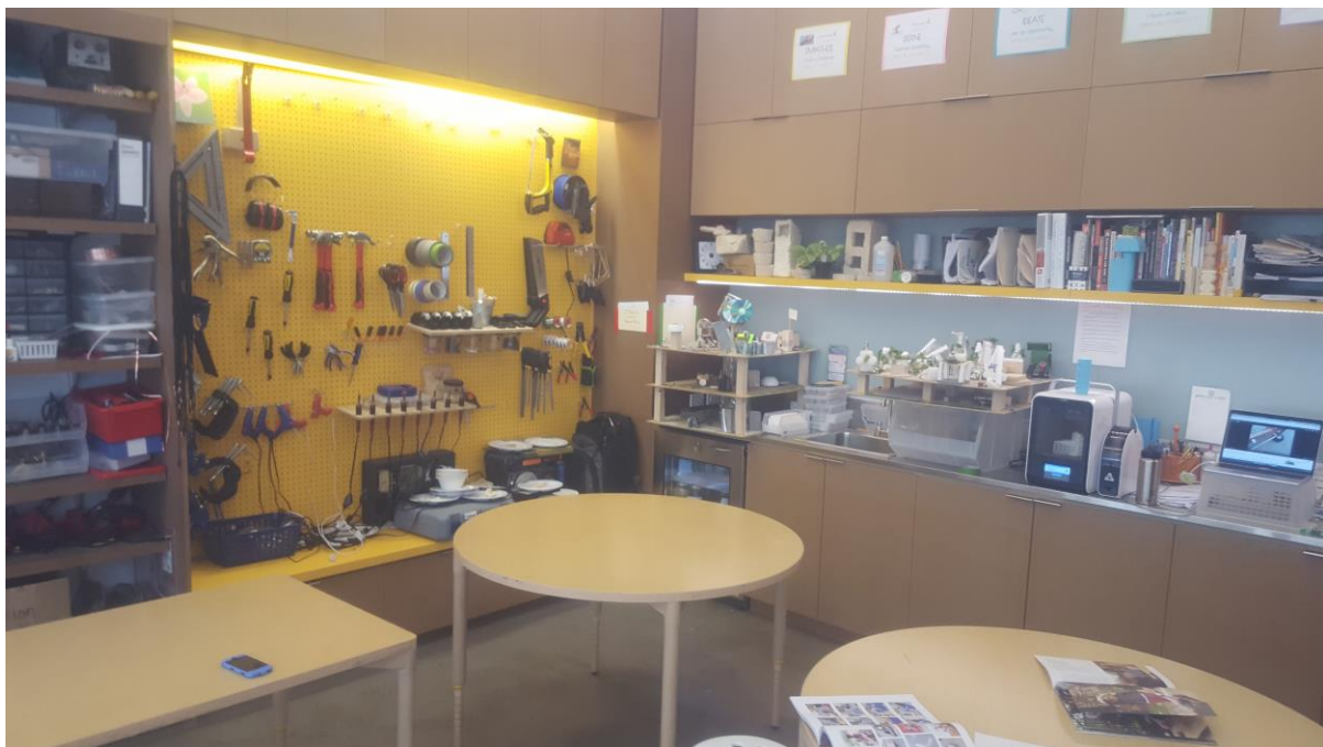
Makerspace at The Blue School - New York City