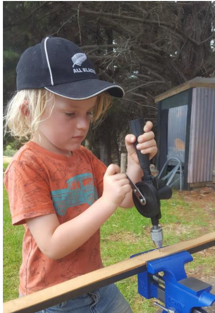
Talking tree school outdoor maker space, New Zealand