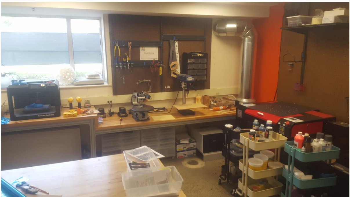
Makerspace at Cambridge Friends School, Boston USA