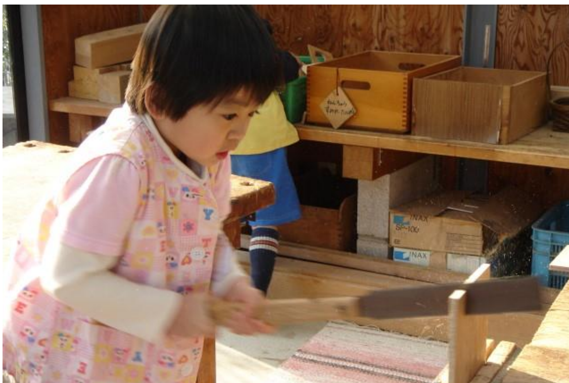
Woodwork at Keade Nursery School, Tokyo, Japan