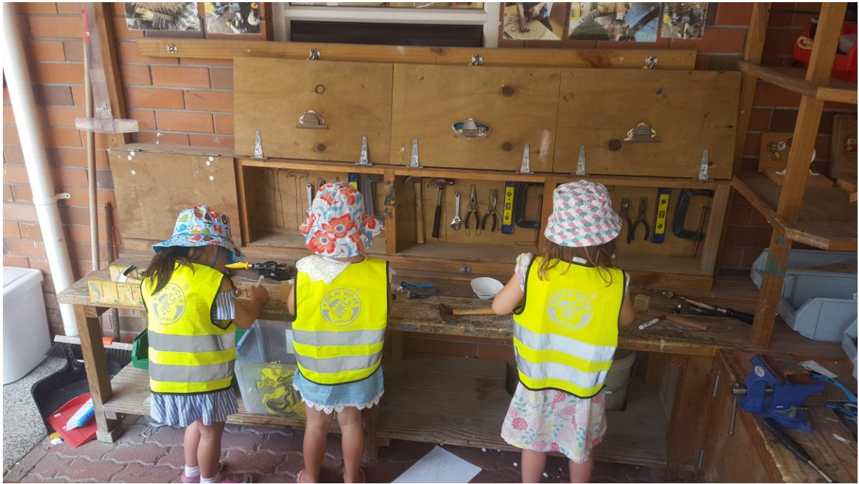
The workshop area at Kids' Domain Early Learning Centre in Auckland, New Zealand