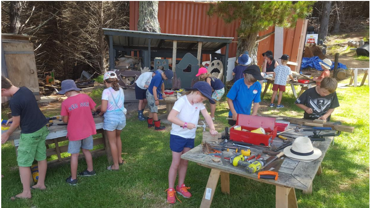
Children at Talking Tree Hill, New Zealand working in the outdoor makerspace