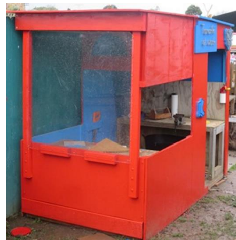
A woodwork area located in the kindergarten garden in New Zealand.