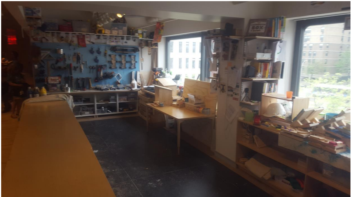
Kindergarten maker space at the Blue School New York City, USA