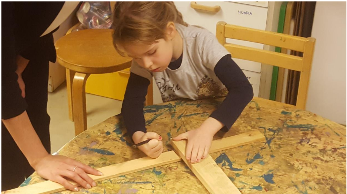
Kindergarten in Pihlaja, Meilahti, Helsinki, Finland.

Children immediately feel valued and feel a sense of responsibility when given the opportunity to work with real tools. They feel valued by being respected and trusted. When children are engaged with real experiences it develops their sense of autonomy and they feel empowered. This has a visible impact on their self-esteem. The fact that they are taking responsibility in working with real tools also seems to be reflected in their desire to take their work seriously.