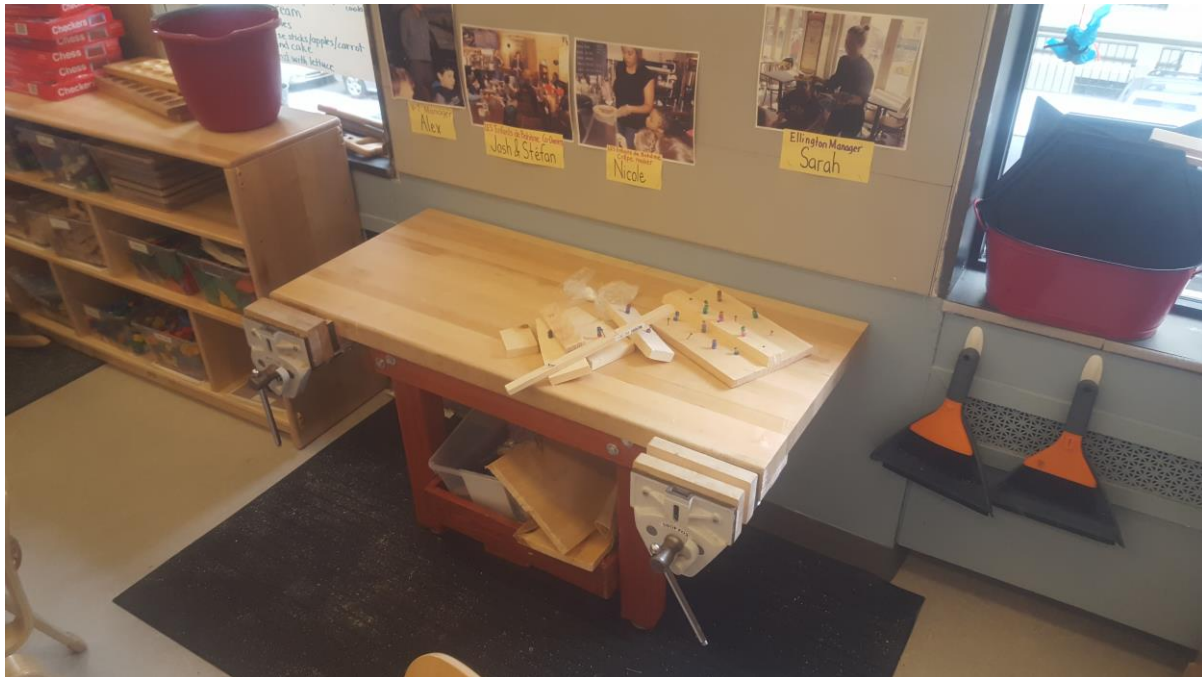
Woodwork set up as part of continuous provision in the kindergarten class at the Bank Street School in New York City