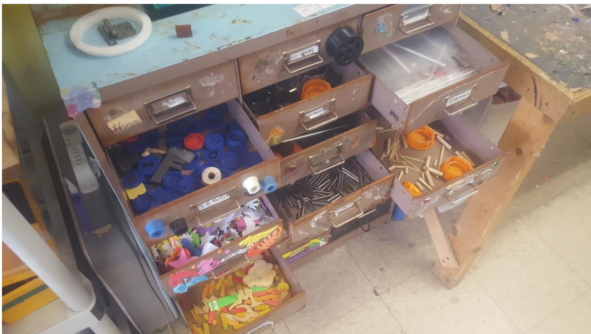
Having a wide variety of additional resources allows more possibilities and facilitates creativity