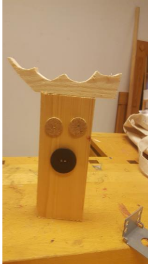
Wooden moose by preschool child in Sweden