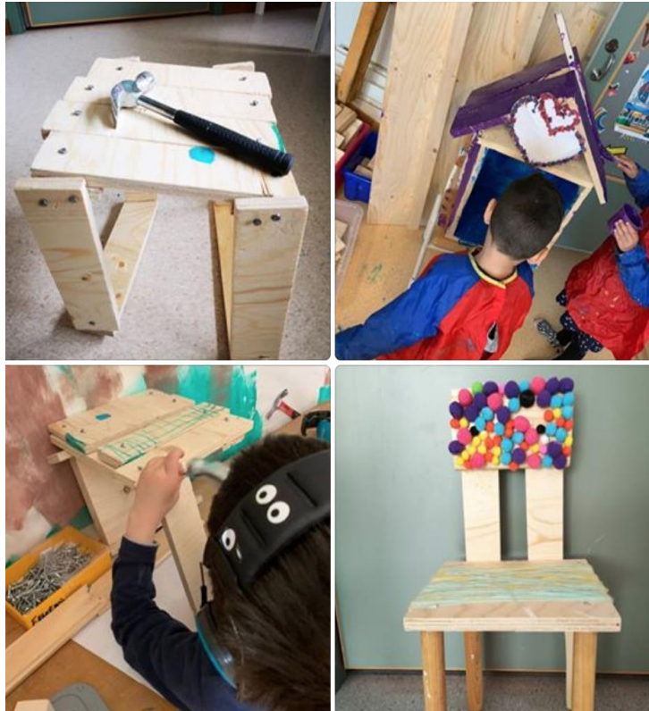
Example of children's woodwork from a Klövervallens förskola kindergarten in Malmo, Sweden.