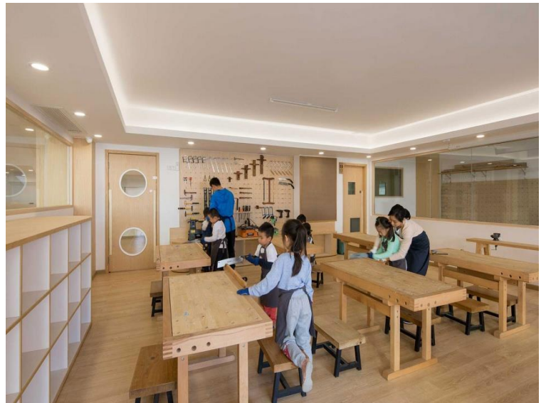
A bookbox made by primary children in NYC Elementary woodwork class in Japan