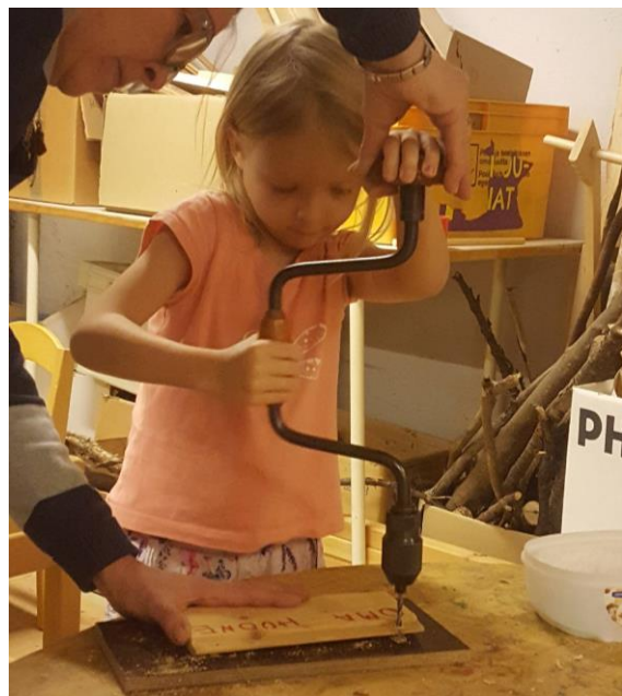
Kindergarten in Pihlaja, Meilahti, Helsinki, Finland.

Woodwork could really be called wood-play, as it is all about playing with possibilities and exploration. In woodwork children explore what they can do with the tools, playing with possibilities. Curiosity is at the heart of their explorations as they test out, investigate and experiment. Initially many children are a little apprehensive about woodwork when faced with the challenge of using equipment that is new to them, but with the correct support and encouragement they invariably find it very easy. Being willing to have a go and not to be restricted by fears is an important attribute of embracing new experience. Regular woodwork sessions embed and build upon existing skills and as children expand their thinking and set themselves new challenges, their skill set and knowledge really develops. Across all phases the progression of skills and knowledge was clearly visible.