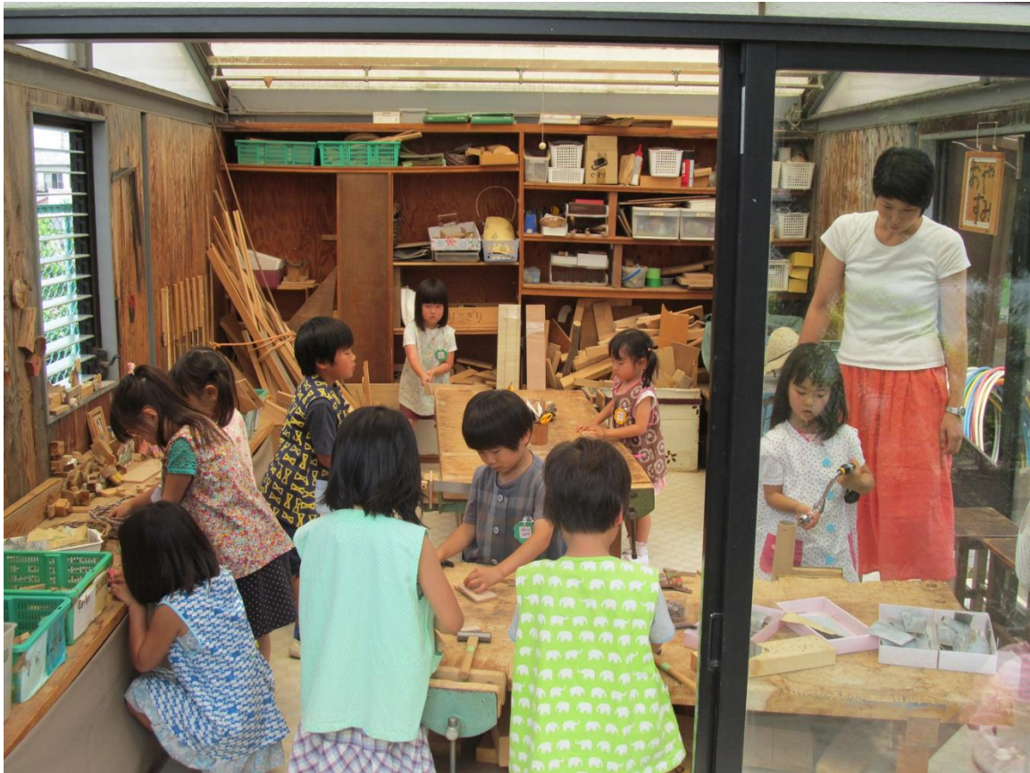
The woodwork studio at Keade nursery school, Tokyo, Japan.