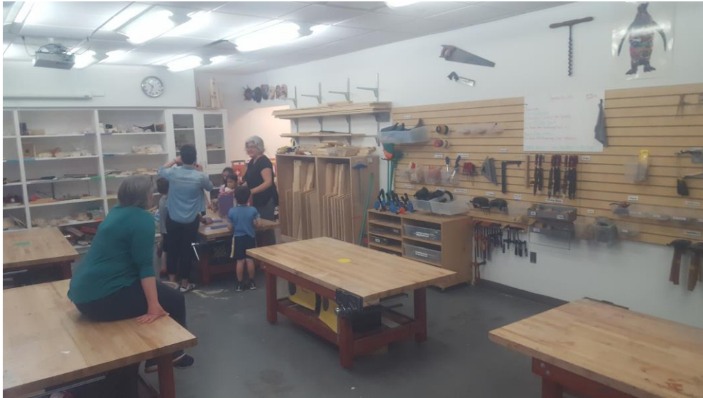
The woodwork shop at the Bank Street School New York City which was accessed by all age groups throughout the elementary school

that form part of continuous provision and there was also a specific woodwork shop which children attended in small groups as they progressed through elementary school. It was evidently clear how much this experience of practical working was valued by the school, children and parents.