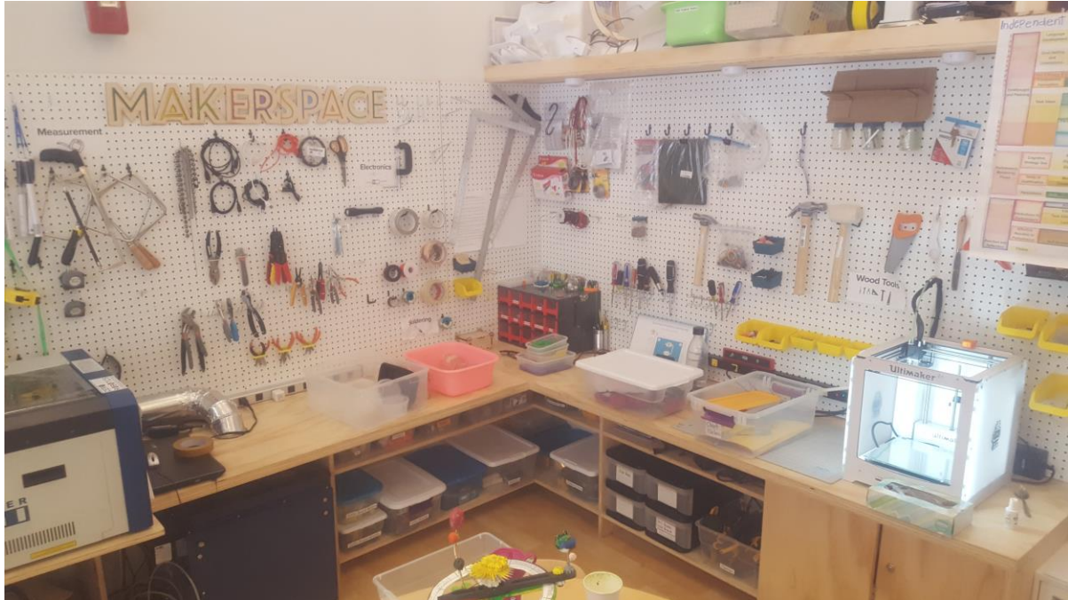
Makerspace at Portfolio School, New York City

movement has momentum, and will continue to play an important role within the education system. STEM / STEAM education is being prioritised within the United States particularly with the aim of developing the economy and developing an entrepreneurial mind set.