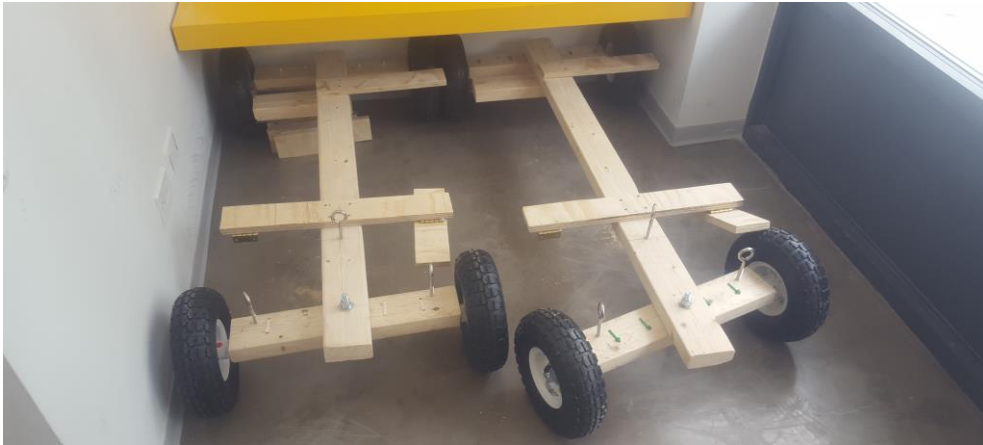
Woodwork project making go-karts by 10-year-old children at the Blue School - New York City.