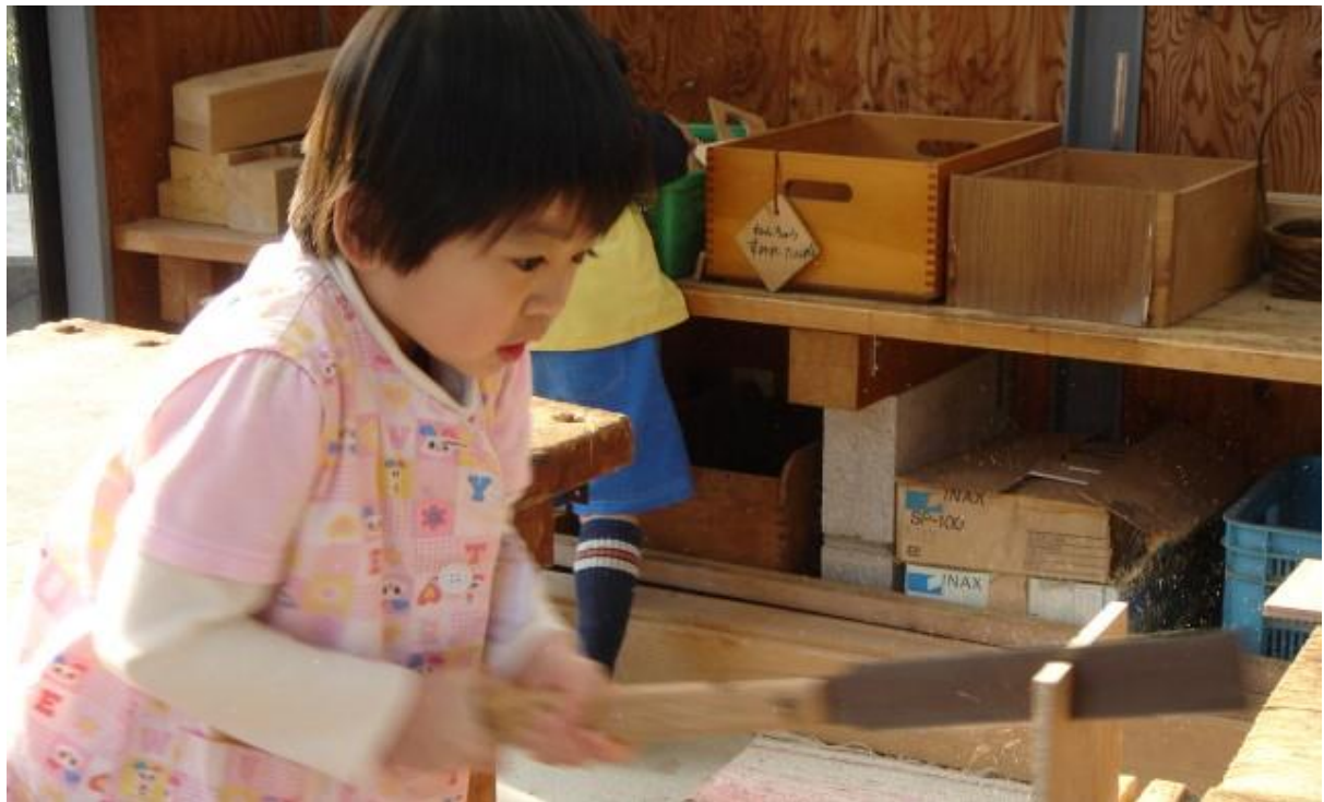
Japanese saws that cut on the pull stroke by far the easiest for children to use