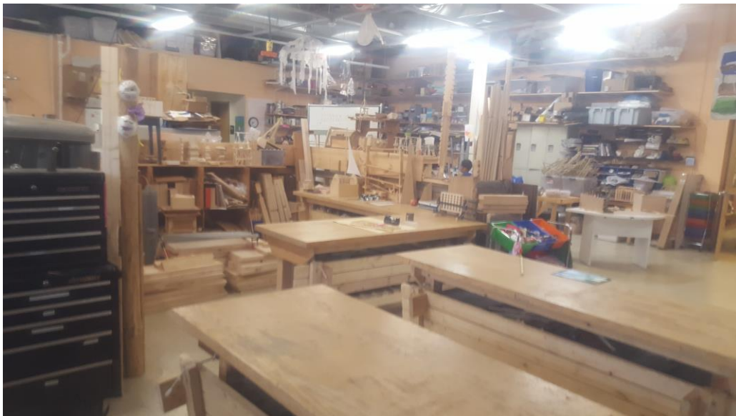
The woodwork shop at ACERA which was accessed by small groups from all classes throughout the elementary school