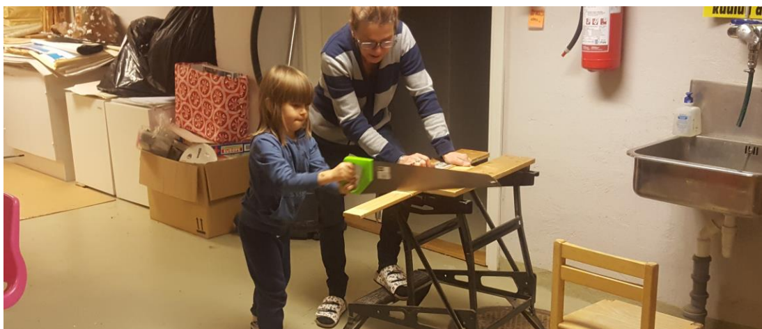
Woodwork activity in Pihlaja, Pre-school Meilahti, Helsinki. Finland.