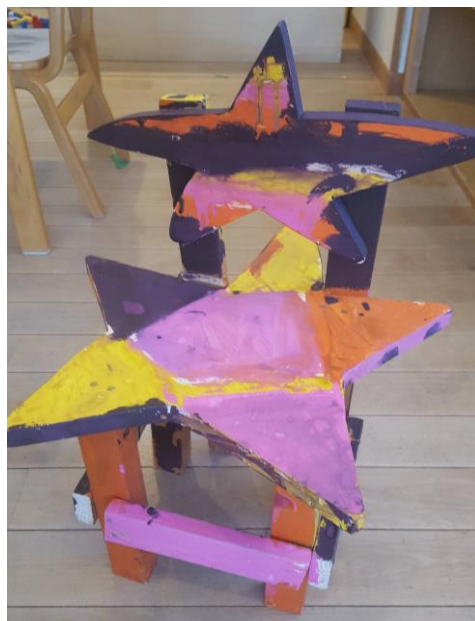
Children's chair designed and made in the woodwork studio in Japan by a five-year-old

Persistence can lead on to doing things with care, putting your best effort in, persevering to find the best solution, striving for quality which will have an impact on how they feel about their work and the pride they take in their product. This attitude was very much encouraged within both Nordic countries and in Japan. This attention to craft is sometimes referred to as integrity. This will involve being patient, taking time, being resilient, persevering, paying attention to detail as well as showing some passion and dedication. Quality is an element that young children can understand and aspire to. It is further developed through the analytical reflective process.