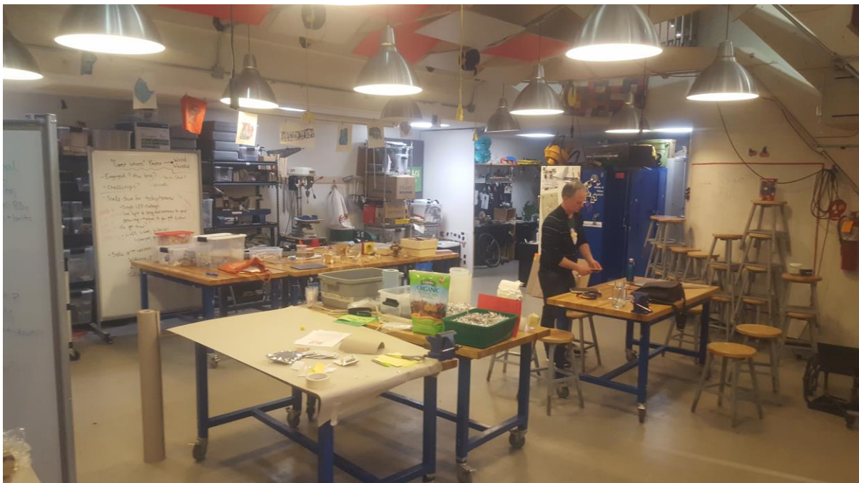
Makerspace at the New York Hall of Science, New York City, USA